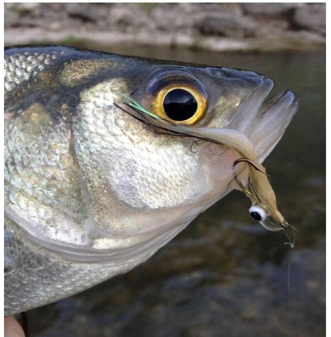
Our club's "logo" fish

So whether you are seasoned pro at this game or just starting out, come out and share what you know, give a report, or learn something new.