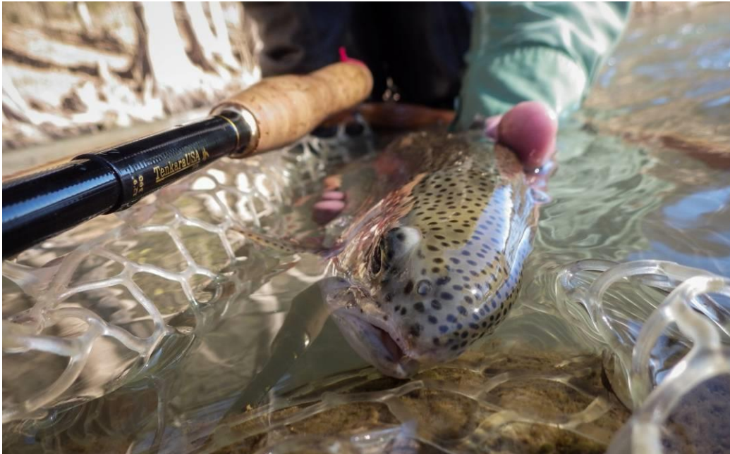
A Guadalupe rainbow on Tenkara

way to introduce young folks to our sport. According to Tenkara USA, you can learn to cast in under 5 minutes.