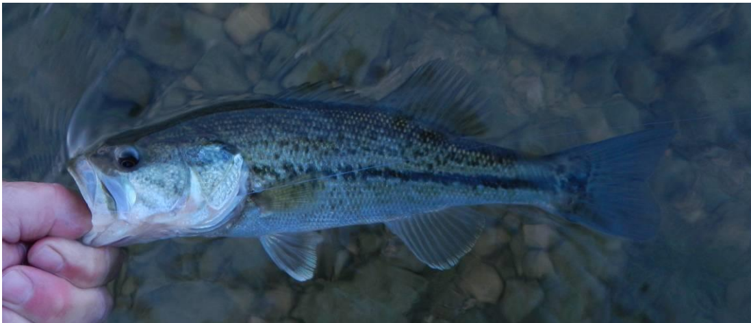
About average in size, but River Bass are always above average in fight.

I decided to go upstream of the bridge and just look around. While I was up there I gave a small pool a try. I am glad I did. This little pool is easy to miss. I know I walked right past it a number of times before I first tried it years ago. Anyway, I lost count of the fish I caught, mostly River Bass. Nothing big, but I was using a very limber 6'6" Orvis Flea, a perfect small stream rod. Those River Bass do put a bend in that little rod. They didn't seem to think the water was cold at all.