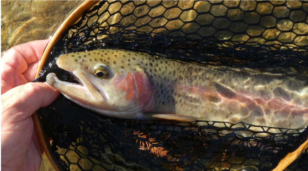
First Trout of the season.

A bigger fish downstream definitely did not want to get netted, but he did. He jumped free of the net before his picture however.