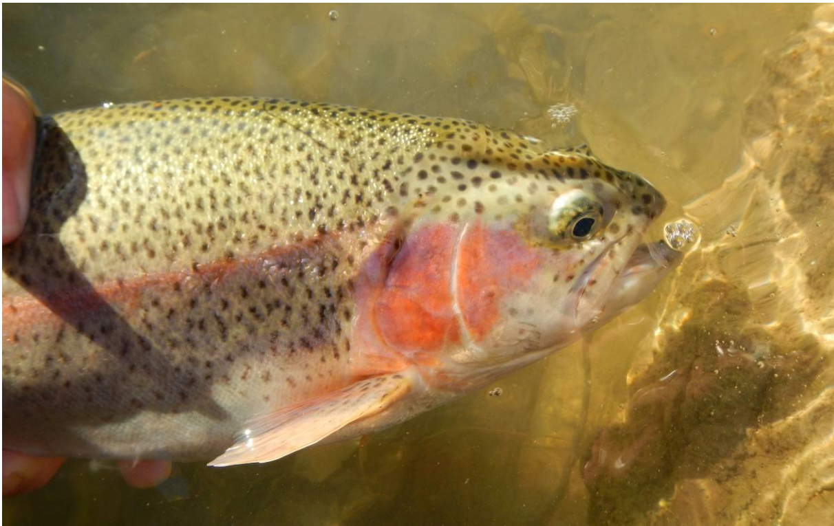
Thanksgiving Day Rainbow

The best way to describe the action is to say that I lost count of the fish I caught. That is not to say it was a double digit morning, it might have been, but I really can't say that because I quit counting around five or six fish. Also, none of these fish came quickly to the net. Almost all were above average in size, which is saying something because GRTU stocks big Trout. Then there was the time spent getting the flies out of the net because I still don't have one of those clear plastic bags. Well I do, but I am having a devil of a time attaching it to the net frame so I was using a back-up net that was really too small for the fish I was catching. Not making an excuse for that Trout lost at the net - not really.