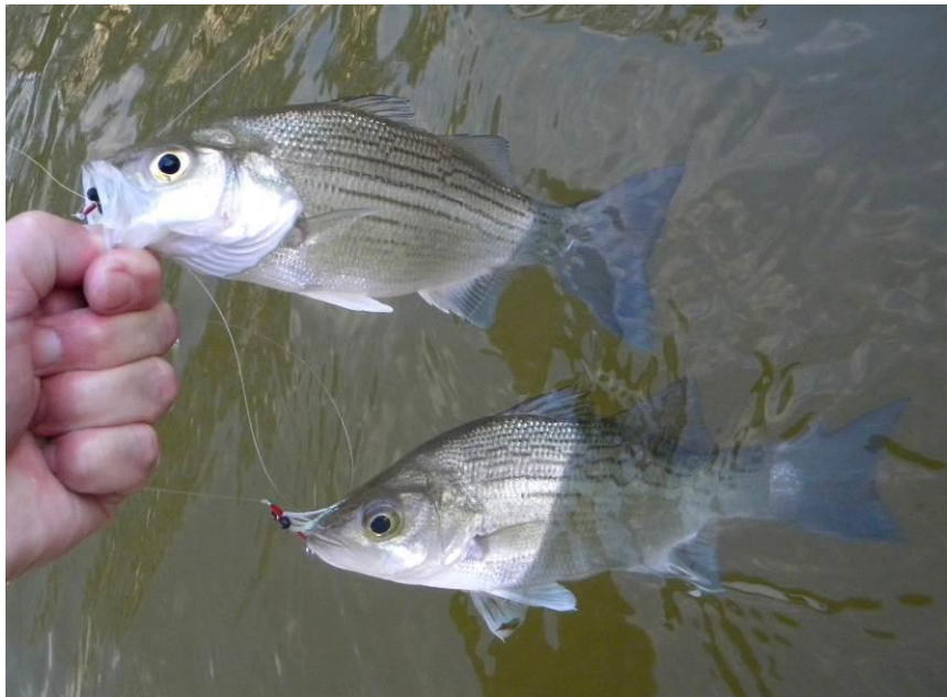
White Bass caught near the former Delmar Ranch Road Access